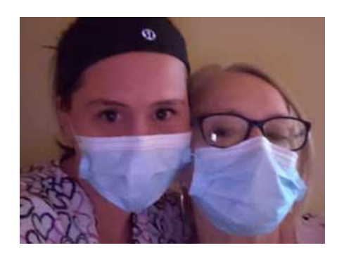
Chartwell Retirement Homes abuse Ontario government COVID-19 emergency directives to disrespect health care workers and put profits over people.