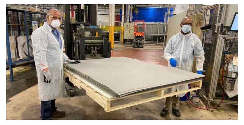
Auto parts supplier members at Woodbridge Foam are making a difference in the battle against COVID-19 as 200 workers begin to produce up to a million medical-grade surgical facemasks a week.