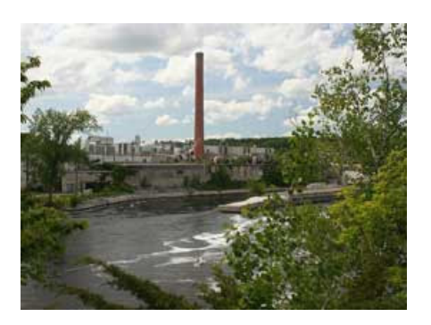
Ontario forestry town loses paper mill after employer decries 'market conditions' but invests in its South Carolina operations.